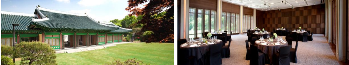
Yeong Bin Gwan

All delegates are cordially invited to join the Formal Dinner at Yeong Bin Gwan at Hotel Shilla and the cultural event around Seoul. Transportation will be provided for the tour.